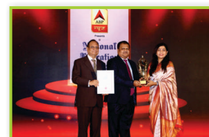
National Education Award for Most Innovative Private University 2019