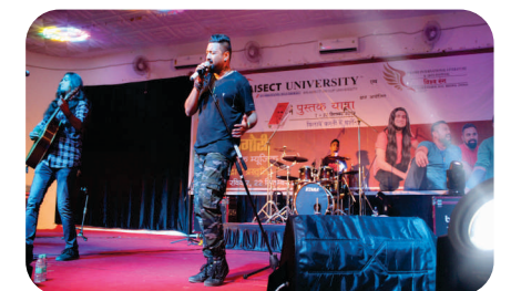
Lagori Band Performance during Pustak yatra 2019 at AISECT University