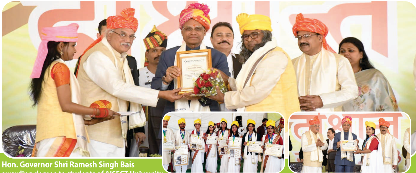
Hon. Governor Shri Ramesh Singh Bais awarding degree to students of AISECT University