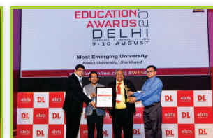
World Education Award for Most Emerging University 2019