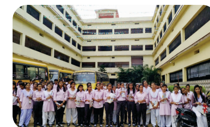
AISECT University Campus